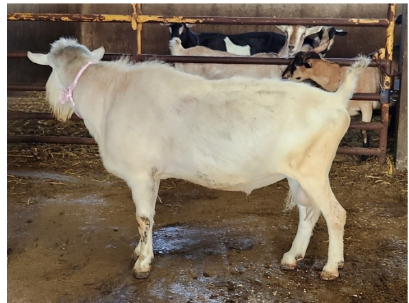
Vineyard View NSD Pegasus

DS: *B Ranea Pepe The Younger D: SGCH Vineyard View Pepe HumuHumu EX92 DD: SGCH Vineyard View Foxy Vana EX92