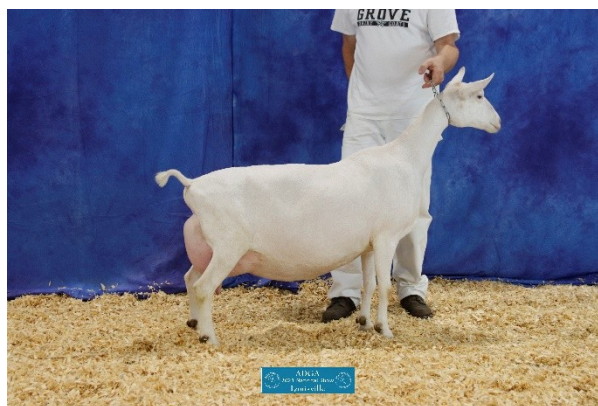
Dam: Pleasant Grove NSMM Gondola EX92

DS: +*B GCH Noble Springs Moscow Mule D: CH Pleasant Grove NSMM Gondola EX92 DD: Pleasant Grove Game Gobble