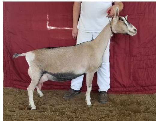
Pleasant Grove Future Risotto EX91

DS: Loughlin's Back To The Future D: Pleasant Grove Future Risotto EX91 DD: CH Autumn Acres My Wisteria EX91