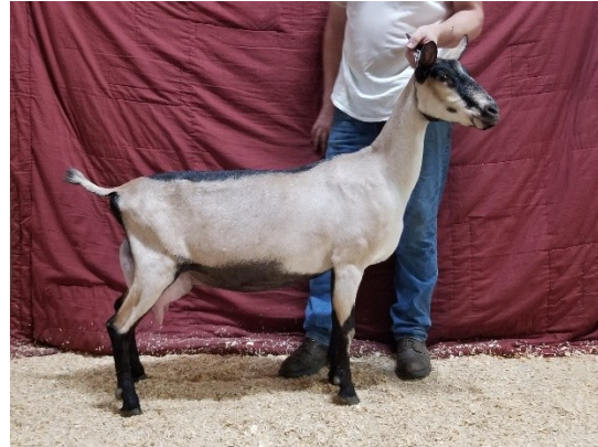
Pleasant Grove Jams Forever EX90

DS: Pleasant-Grove RR All Star Jam D: Pleasant Grove Jams Forever EX90 DD: CH Pleasant Grove Machine Fixed EX91