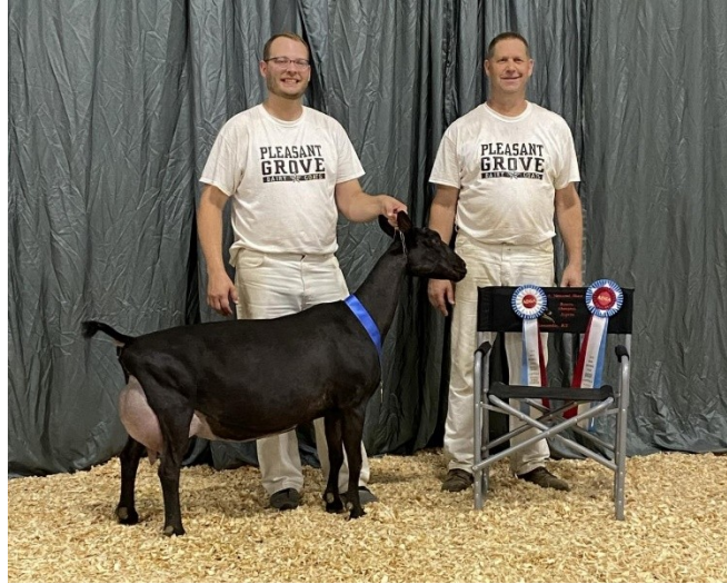
CH Pleasant Grove WFM Repaid EX92 2024 ADGA National RGCH and Reserve Best Udder