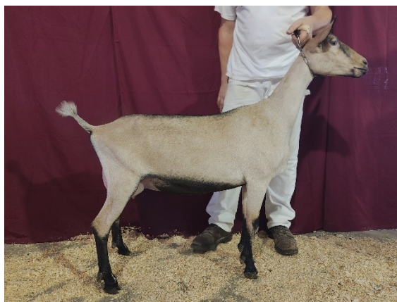
Pleasant Grove Long Motor

DS: CH Pleasant Grove Zen Wingnut D: Pleasant Grove Nutty Motto VG89 DD: Pleasant Grove Frame Motif EX90