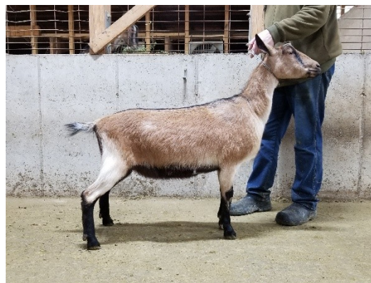
Sip dau: Pleasant Grove Frame Size

62. Pleasant Grove Jam Siesta A2117722 LA 2-06 EX91 EEEE Born 2-28-19 LA 4-06 EX92 EEEE DHIA 1-10 305d 5290M 3.6% 194F 2.8% 145P 2-11 294d 4020M 3.5% 142F 2.8% 117P 3-11 287d 4023M 3.5% 141F 2.7% 107P 4-11 288d 4645M 3.6% 166F 2.6% 123P SS: +*B SGCH Marran Rose's Rochester S: Pleasant Grove RR All Star Jam SD: CH Pleasant Grove Zorro Jamboree EX91 DS: Pleasant Grove RR Freeze Frame D: Pleasant Grove Framed Sienna VG89 DD: Pleasant Grove Sip O'Moonshine VG89