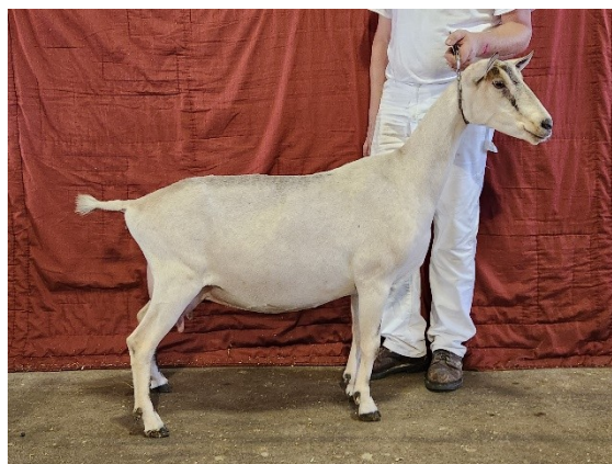
Pleasant Grove Seinfeld Mimosa EX91

DS: Mainstay KSP Seinfeld D: Pleasant Grove Seinfeld Mimosa EX91 DD: Pleasant Grove Epic Mission