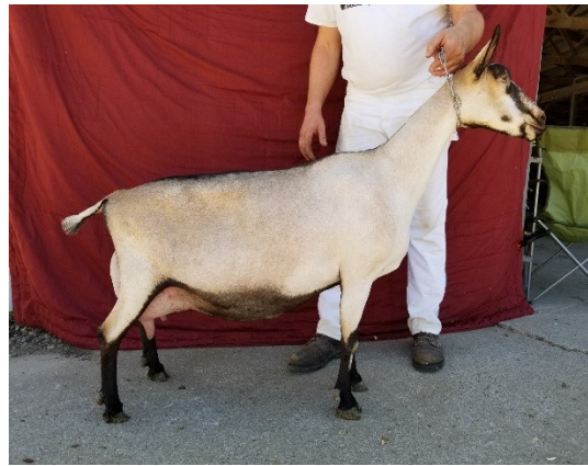
Dam: CH Pleasant Grove Zorro Jamboree

10. Pleasant Grove WFM Jamba A2125109 LA 4-07 EX91 EEEE Born 1-25-19 DHIA 3-00 291d 2462M 3.6% 89F 2.8% 70P 4-00 305d 2737M 3.3% 90F 2.7% 75P 5-01 253d 2525M 3.7% 93F 2.8% 70P SS: *B Windrush Farms Wonder Blizzard S: Windrush Farms Blizzard Manny SD: Windrush Farms IRS Emily DS: *B Pleasant Grove Act Menacing D: CH Pleasant Grove Zorro Jamboree EX91 DD: Pleasant Grove Amen I'M Jammin EX91