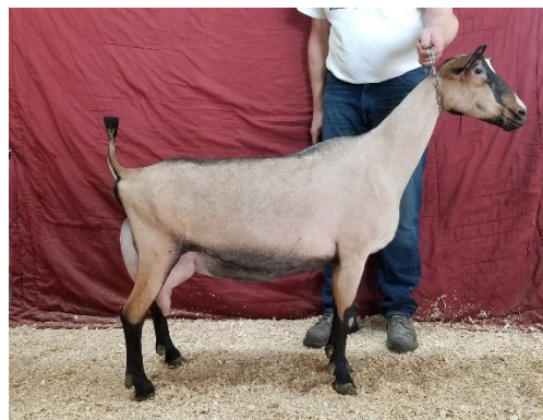
Dam: Pleasant Grove Frame Myina EX91

28. Pleasant-Grove Medallion Mylion A2205298 LA 3-07 VG88 VEVV Born 1-29-20 DHIA 2-00 289d 3105M 2.9% 91F 2.8% 88P 3-00 265d 3542M 3.0% 108F 2.7% 95P 4-00 289d 3690M 2.8% 102F 2.7% 100P (INC) SS: +*B Hoach's NW Zeanna Genesis AI S: *B Hoach's Rose Medallion SD: GCH Crystal Creeks Irish Rose