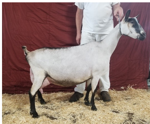
CH Pleasant Grove RR Jezebel EX92

DS: ++*B SGCH Marran Rose's Rochester D: CH Pleasant Grove RR Jezebel EX92 DD: Pleasant Grove Dreamt of Jeani