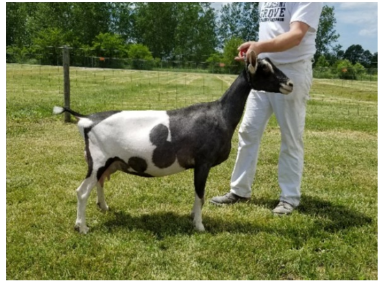
Dam: Pleasant Grove Future Rent VG88

DS: Loughlin's Back To The Future D: Pleasant Grove Future Rent VG88 DD: Pleasant Grove 4 Sins I Repent EX91