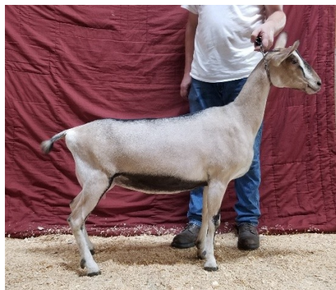
Pleasant Grove Frame Myona @ 1yr

29. Pleasant-Grove SSO Myona A2184524 Not Appraised Born 1-23-21 DHIA 1-00 297d 2190M 3.1% 67F 2.9% 63P 3-00 284d 3090M 2.9% 90F 2.7% 84P (INC) SS: *B Pleasant Grove Liason Superior S: *B Pleasant Grove Super Standout SD: SGCH Stardust Cordite Saba EX93