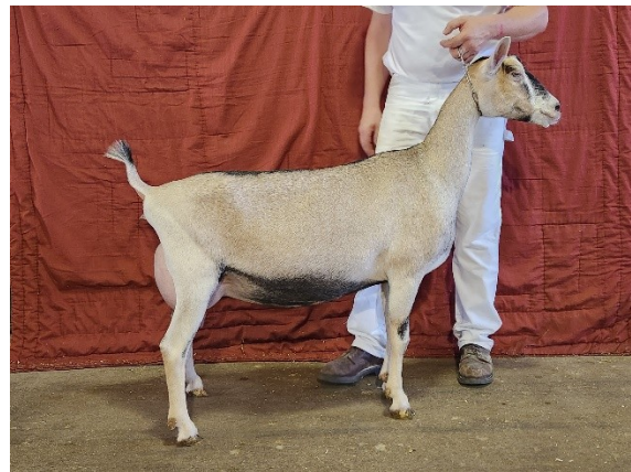
CH Pleasant Grove JT Salsa EX90

DS: Pleasant-Grove Future Jailtime D: CH Pleasant Grove JT Salsa EX90 DD: Pleasant Grove Framed Sienna VG89