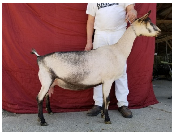
Dam: Pleasant Grove Framed Moana

DS: Kickapoo Valley Illusional XXX D: Pleasant Grove Framed Moana VG89 DD: Pleasant Grove Measured Sins EX90