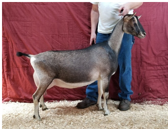
Pleasant Grove WFM Materialize EX91

DS: ++*B Windrush Farms Blizzard Manny D: Pleasant Grove WFM Materialize EX91 DD: Pleasant Grove RR Matrix EX92