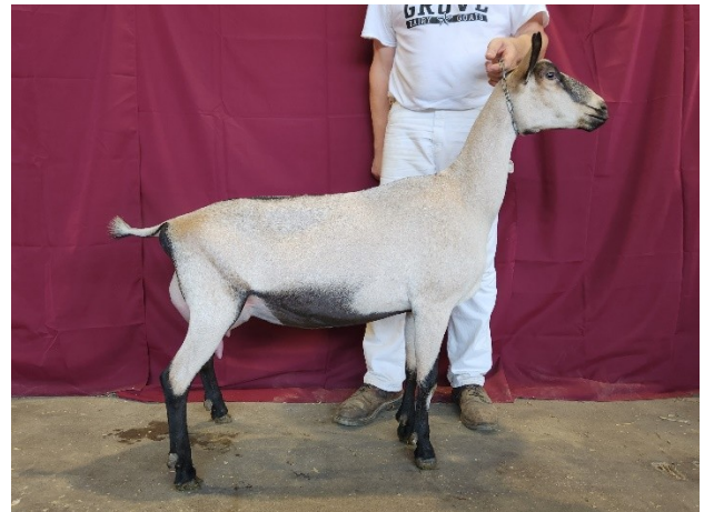
Pleasant Grove Marcos Risatta

DS: Loughlin's Back To The Future D: Pleasant Grove Future Risotto EX91 DD: CH Autumn-Acres MY Wisteria EX91