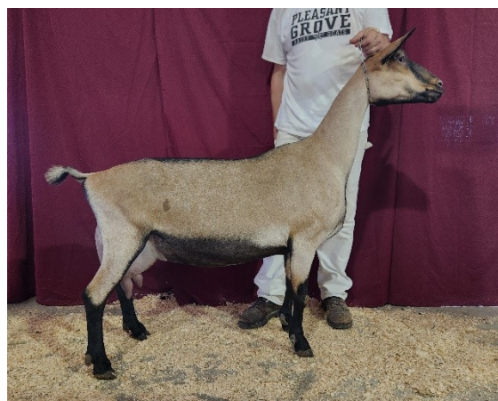
Pleasant Grove Nutty Motto

51. Pleasant Grove Nutty Motto A2184522 LA 2-06 VG89 VVVE Born 2-2-21 DHIA 2-00 305d 2885M 2.6% 75F 3.1% 90P 3-00 292d 4098M 2.4% 99F 3.0% 124P SS: *B YBNVS Revolutionary Zen S: CH Pleasant Grove Zen Wingnut SD: SGCH Kickapoo Valley Saga Whimper EX92 DS: Pleasant Grove RR Freeze Frame D: Pleasant Grove Frame Motif EX90 DD: CH Pleasant Grove Nutty Material EX91