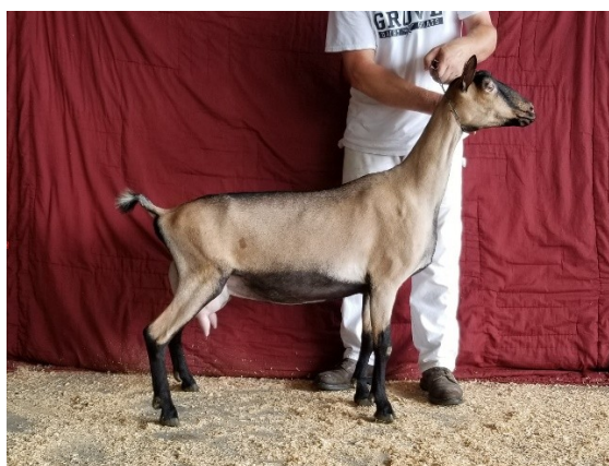
Pleasant Grove Nutty Motive – yearling pic

DS: Pleasant Grove RR Freeze Frame D: Pleasant Grove Frame Motif EX90 DD: CH Pleasant Grove Nutty Material EX91